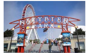
Navy Pier—Chicago Lake Front